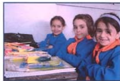
Children in Syria receive school and hygiene kits.

Please bring donations by September 28 th !