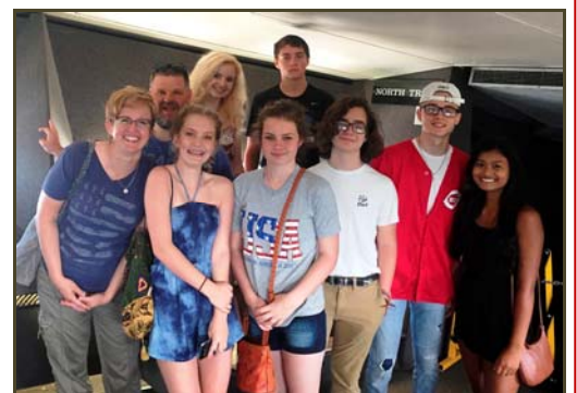
Youth Group visiting the St. Louis Arch.