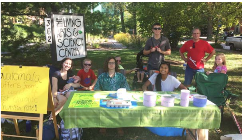
Youth Group education station at the Lexington CROP Walk.

Thank you to all who supported our Youth Group participation in the 30 th Annual Lexington CROP Walk.