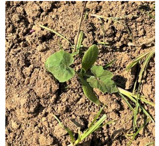
Volunteer plant in our garden

And then I get to thinking about all that little seed has endured and my awe only increases. At the end of the season each fall the garden gets mowed over. In the winter we have freezes, snow and ice storms that blanket the garden. Then in early spring the entire garden is turned over with a tractor pulling the big discs. After our individual spots are marked off, we go in with a rototiller and churn everything up.